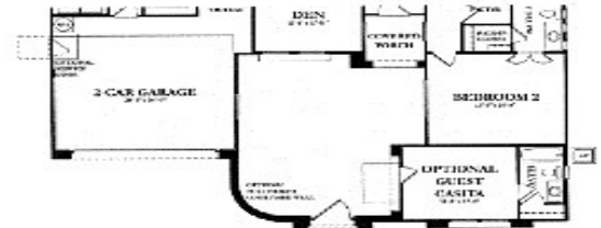
OPTIONAL FULL HEIGHT OR 4' COURTYARD WALL WITH GUEST CASITA