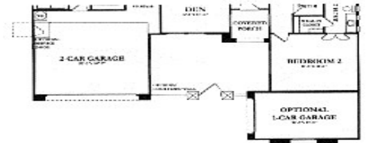
OPTIONAL 4' HIGH COURTYARD WALL WITH GATE