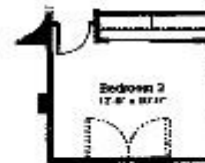
Optional Bedroom 2