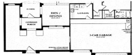
OPTIONAL FULL HEIGHT COURTYARD WALL WITH DOOR