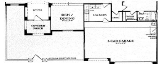
OPTIONAL 4' HIGH COURTYARD WALL WITH GATE