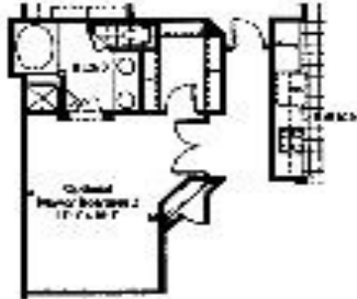
Optional Master Bedroom 2 (Elev. A, B, & C Only)