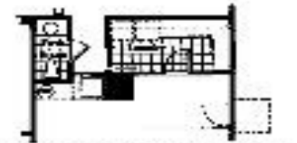
Optional Laundry/Powder Room