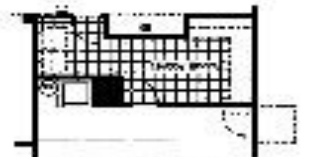
Optional Hobby Room